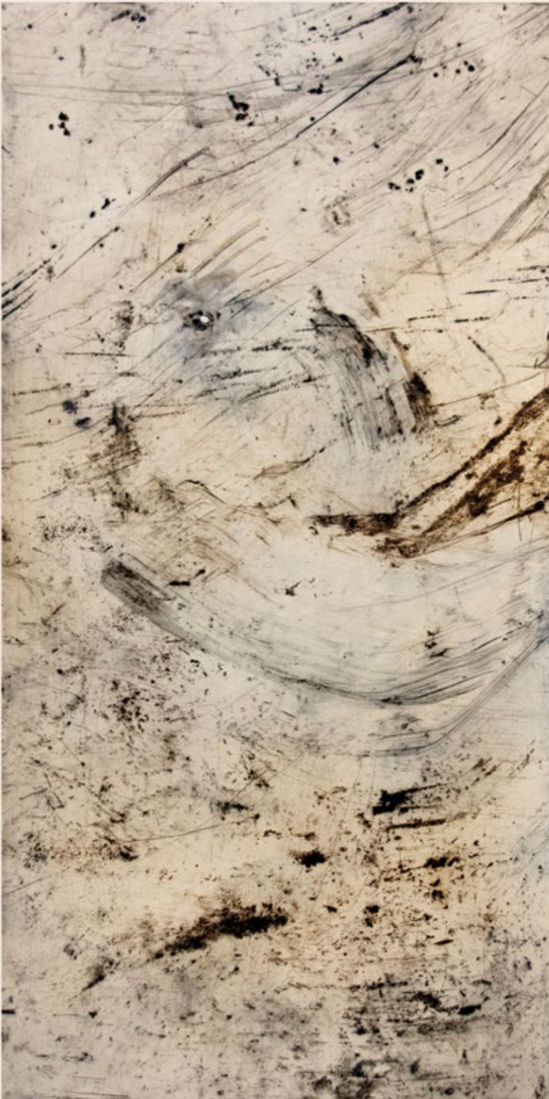
Memories of The Leonardo I, 2019, Ed 1/1 (Drypoint etching on 340gsm Hahnemühle paper, 100x50cm)

such as only doing urban work. I could never do that; I'd become bored very quickly. I don't see myself as that kind of artist. I'm not a factory, and I don't make factory pieces. Art should develop and be inspired by what inspires the artist at that moment. Regardless of how conceptual the work, and how different the medium, there will be a continuation or golden thread that brings all my work together, because I am the one creating it."