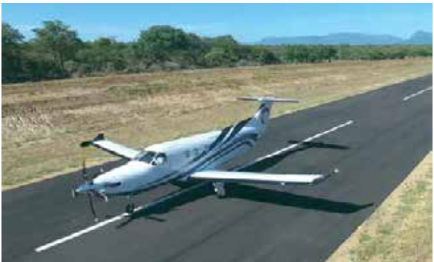
ABOVE: Reception area at River Lodge LEFT: Kapama's Pilatus PC-12