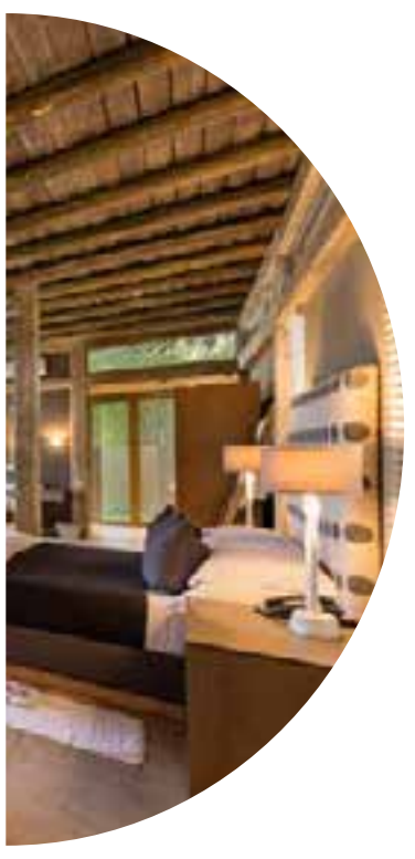
Villa living at Kapama Karula

towards the Greater Kruger area, Kapama Private Game Reserve comprises four diverse, luxurious bush camps and lodges. Each is carefully positioned within this wildlife sanctuary, and offers a fresh approach for your safari holiday.