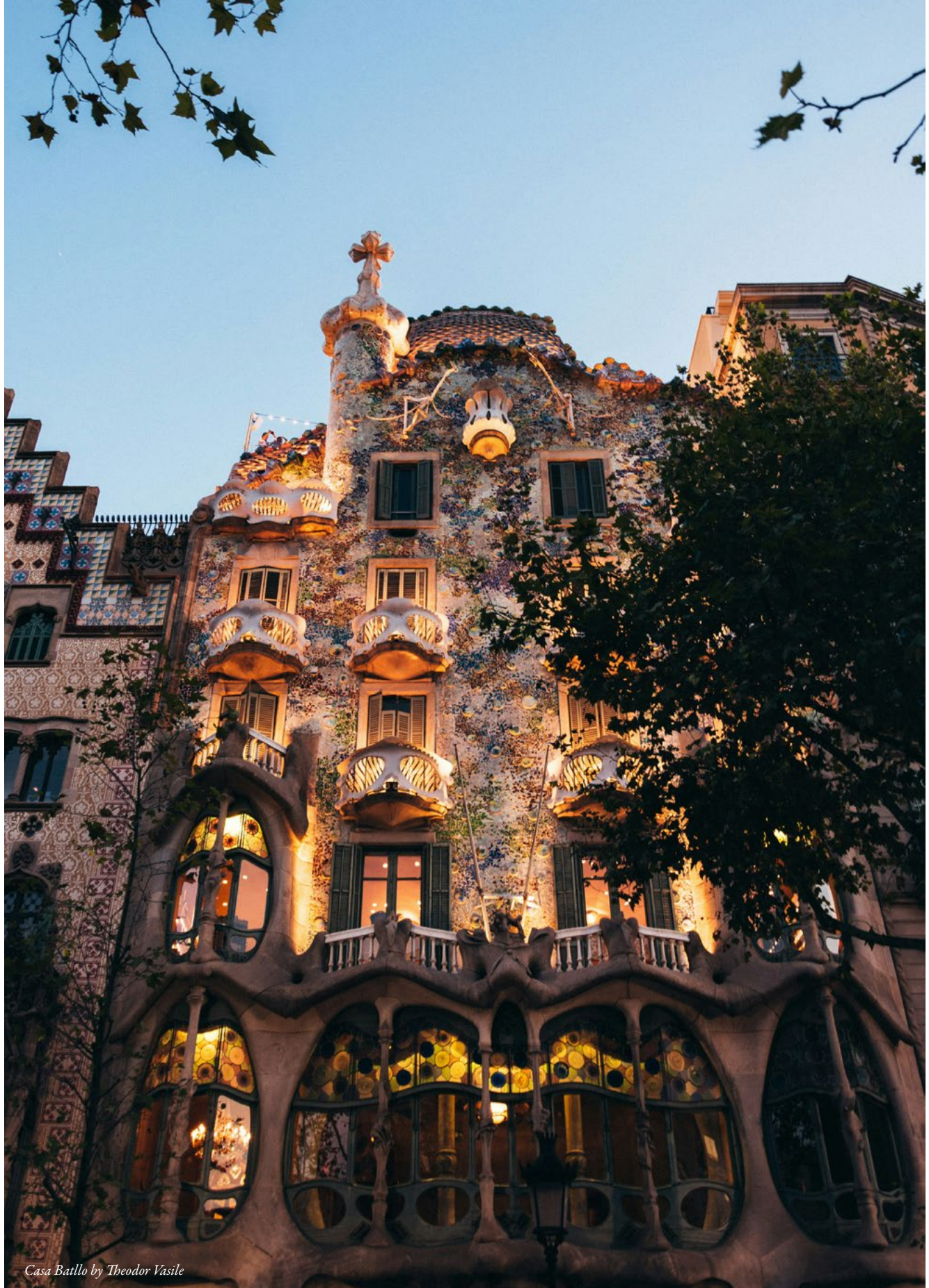
Casa Batlló by Theodor Vasile