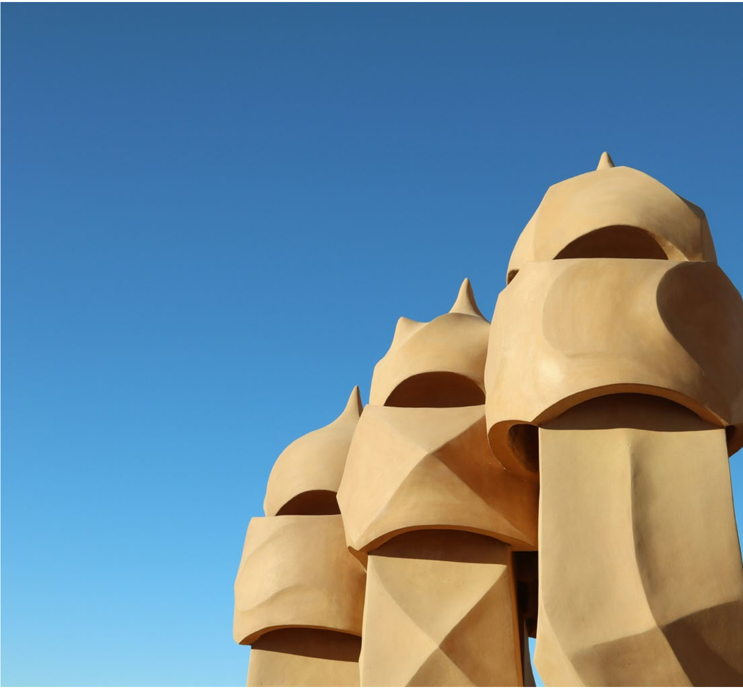
Casa Milà by Yevheniia