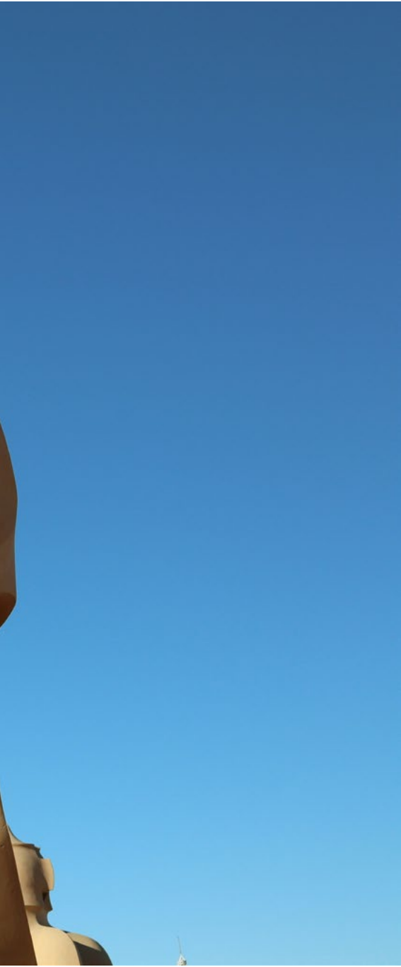
Attic arches of Casa Milà