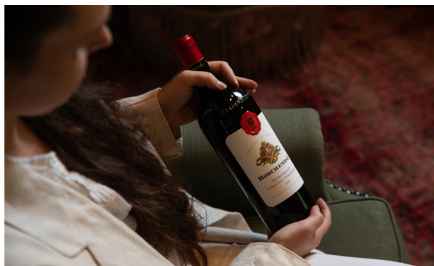
2021 Boschendal Stellenbosch Cabernet Sauvignon