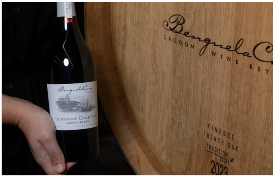
2021 Benquela Cove Lighthouse Collection Moody Lagoon Red